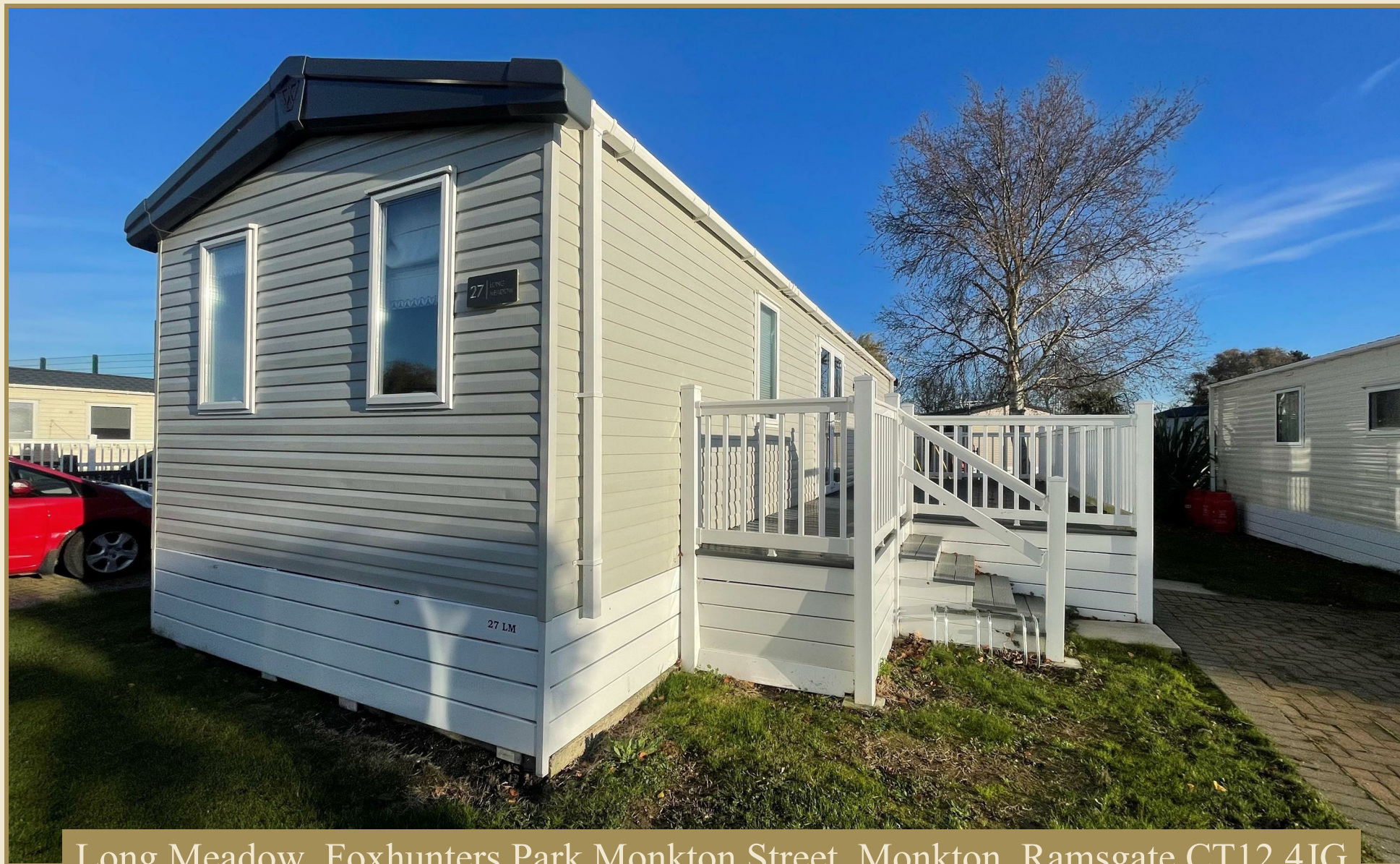
Long Meadow, Foxhunters Park Monkton Street, Monkton, Ramsgate CT12 4JG